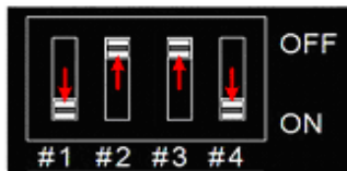
Factory Default DIP switch settings for NN1, VX2 & NN3D when using standard Hub.