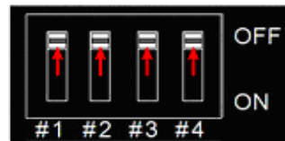
Dip switch settings for NN3D when using HUB101.

If you have more than one network sounder in the system, please contact Furuno Tech Support for setup information.