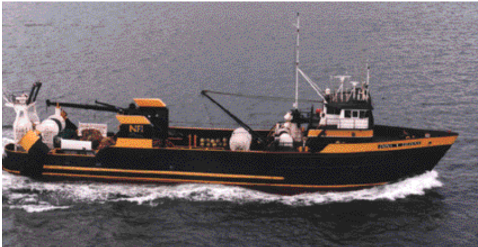
Nina Fisheries trawler DONALILLIANA